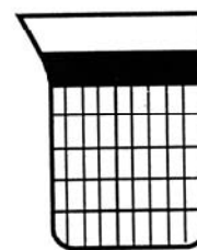
1:5 157cc or 5½ oz. ACU-1 concentrate balance water to make 946cc (1 quart)